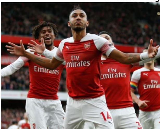
Pierre Emerick Aubameyang Scored 2 in the North London and hit 16 Points