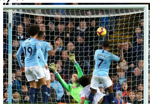
Sterling scores for City contributing to his 9 point haul